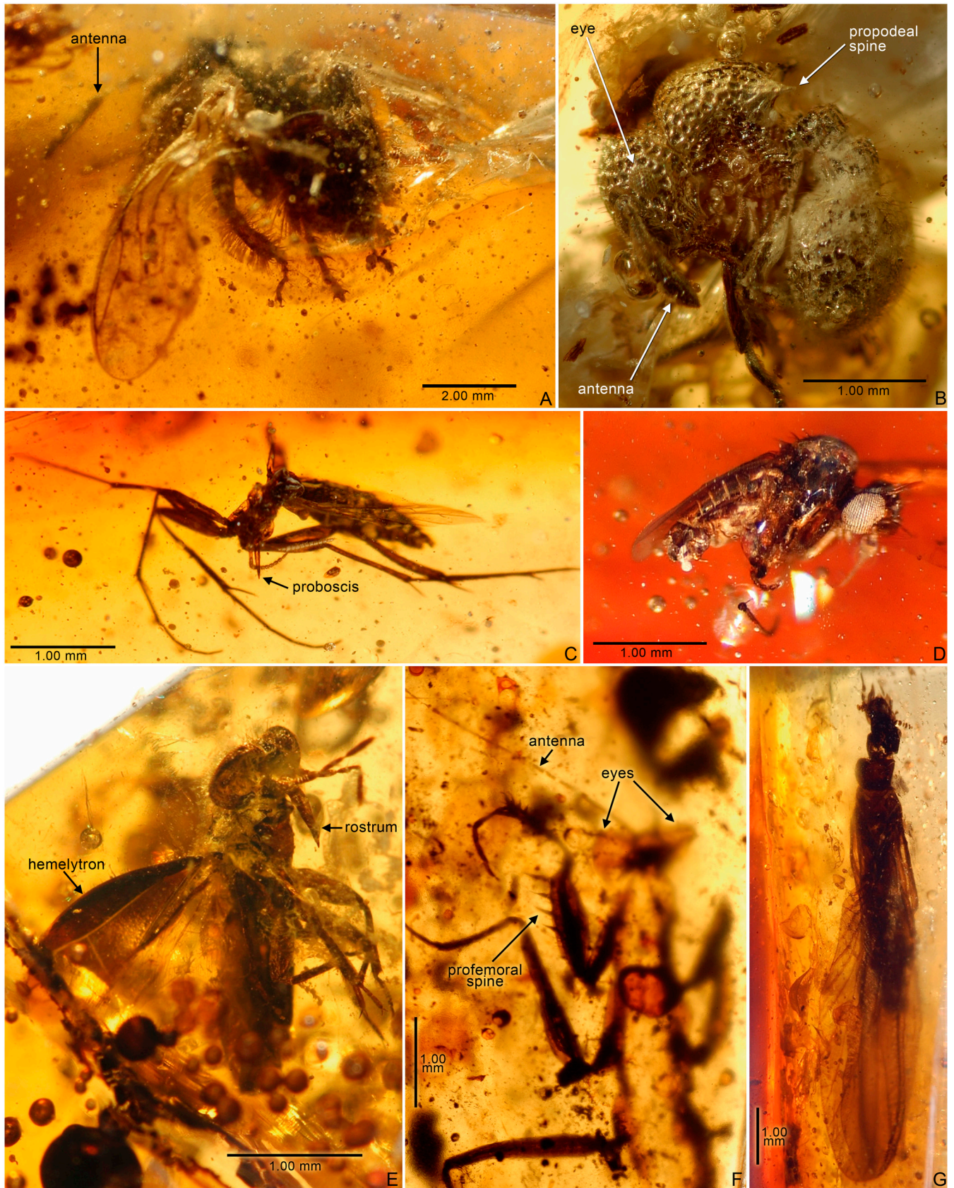
Fig. 2. Representative insects in Cambay amber of biogeographic and ecological significance. Taxa have closest known relatives in Baltic amber (A and C), Recent of southeast Asia (B and D), or the Neotropical Region (E and F); some of these taxa are also eusocial (A, B, and G). (A) Bee, near the extinct genus Melikertes (Apidae: Melikertini). (B) Sculptured myrmecine ant (Formicidae), near the Recent southeast Asian genus Lordomyrma . (C) Fungus gnat, Palaeognoriste (Diptera: Lygistorrhinidae). (D) Scuttle fly, Rhopica (Diptera: Phoridae). (E) Leptosalda bug (Leptopodidae: Heteroptera). (F) Mantis nymph of the family Chaeteessidae (Mantodea). (G) Alate termite (Isoptera), family Rhinotermitidae.